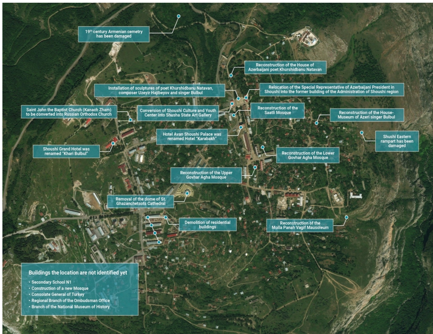
Map 2: Armenian Cultural Sites Altered by Azerbaijan Since January 2021