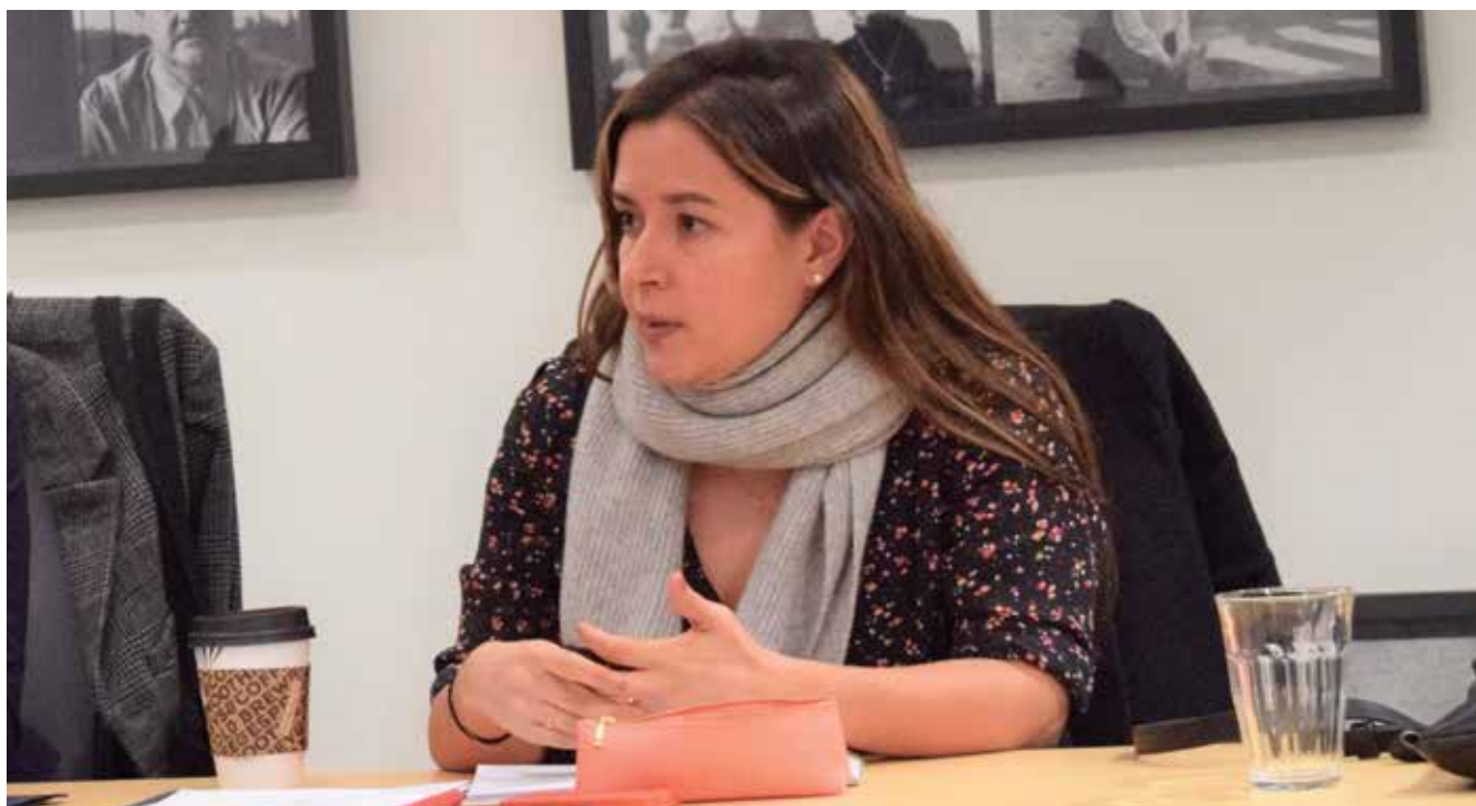
The advocates met with Robert F. Kennedy Human Rights during the DC trip.