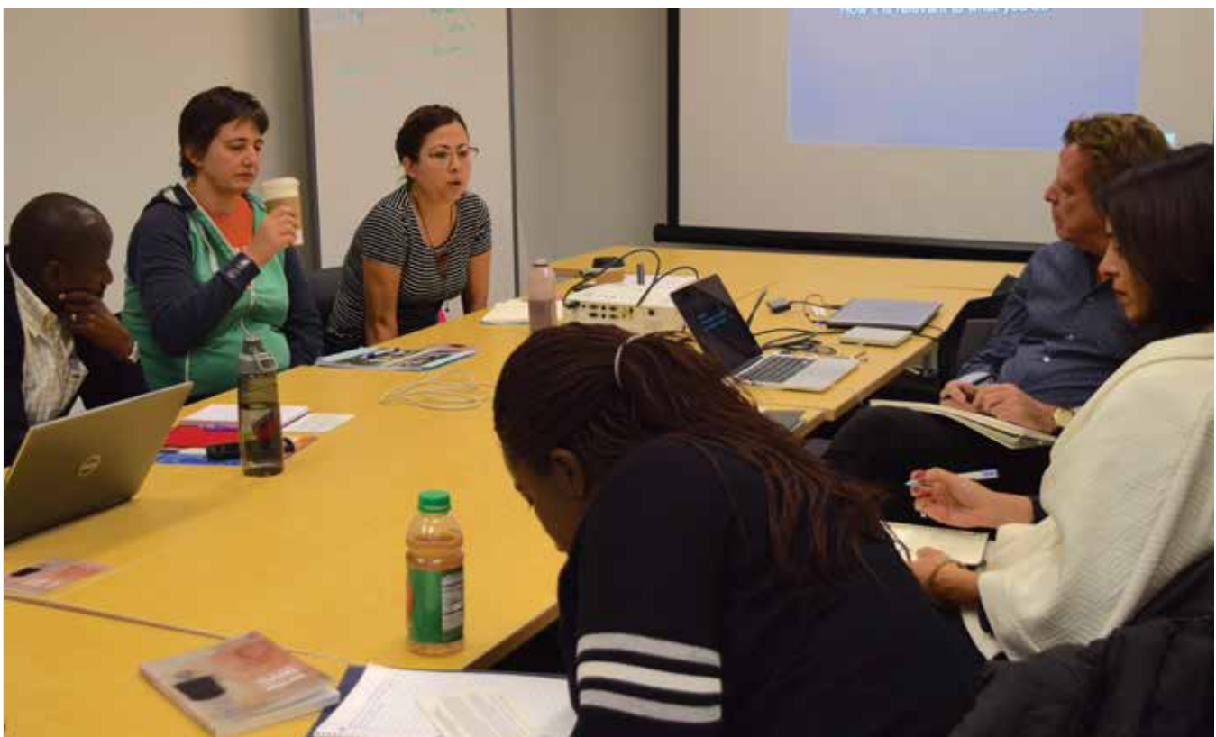
The advocates attended an interactive workshop on stress management.

What I want to say is that I do this work because it is the natural thing for me to do. I'm a problem-solver. I'm dedicated to making sexual and reproductive rights accessible to women and adolescents now. For me it is obvious that this is not the world that we deserve, that we need to work together to change it, that women cannot wait any longer.