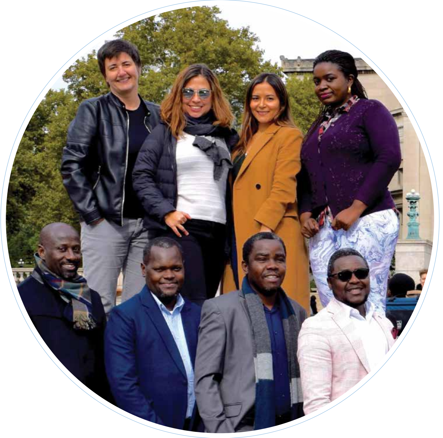
2018 ADVOCATES: The 2018 Advocates were in the 30th Class of HRAP.