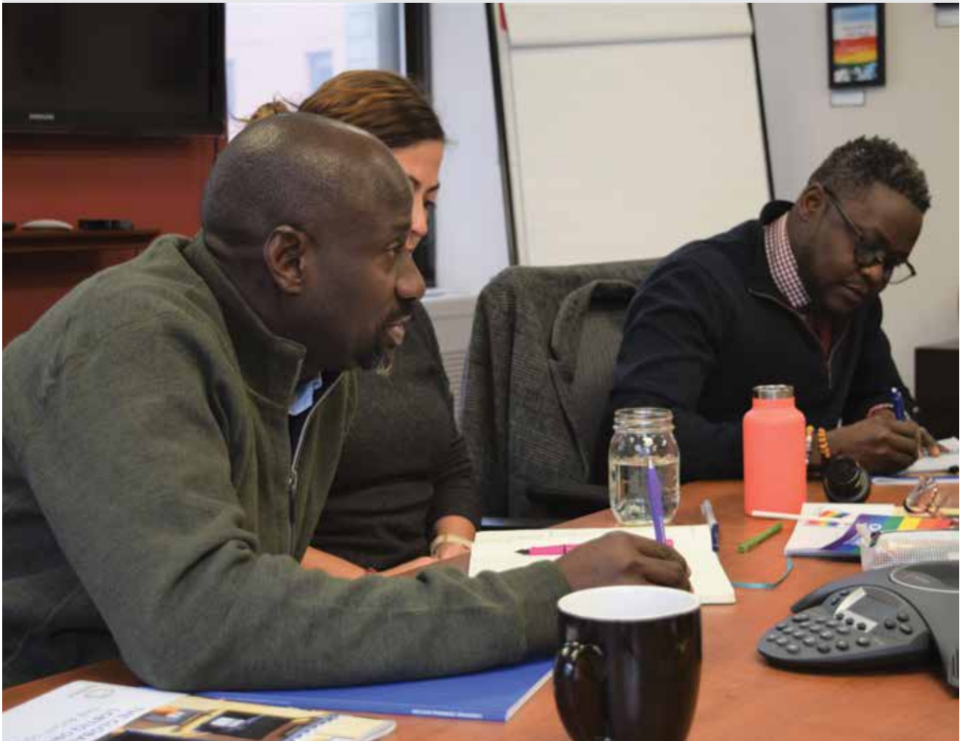
The advocates attended networking meetings in NYC and DC.

camps. I started enjoying human rights work especially when I assisted persons whose rights were under threat or attack and created awareness about vulnerable groups. Since then, I have developed a passion for human rights and have never worked looked back. My graduate studies in Oslo, Norway, as well as my travels to interact with other human rights specialists and practitioners have shaped my ideas and understanding of the subject. This has increased my liking and passion for the same. Working in the human rights sector exposed me to new skills and knowledge of applying human rights in our day-to-day life. The greatest memory I have is when I became