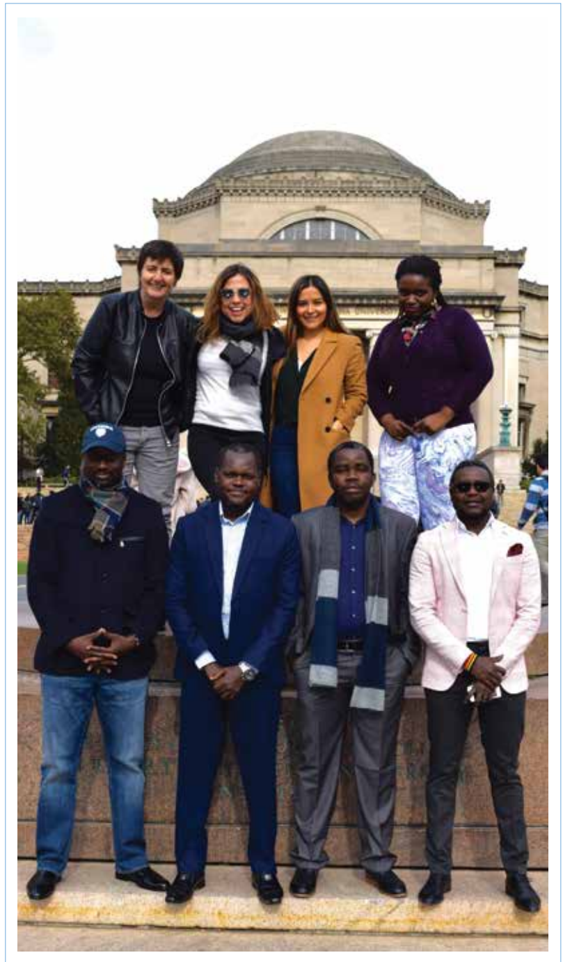
The 2019 HRAP cohort on the Morningside campus.