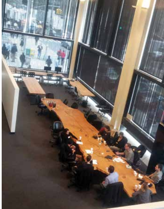
(Left): AHDA fellows examine archival material relevant to their work during a workshop at CHRDR. (Right): Workshop with museum design expert, Paul Williams.