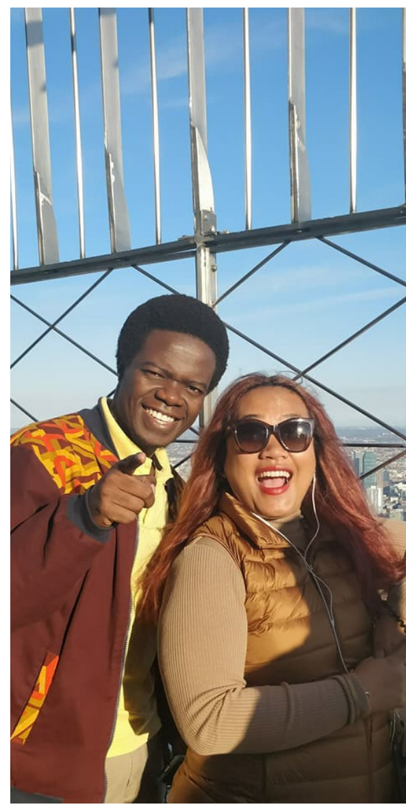
Human Rights Watch kindly provided the advocates with a visit to the top of the Empire State Building.

Inga Winkler, Director of Undergraduate Studies