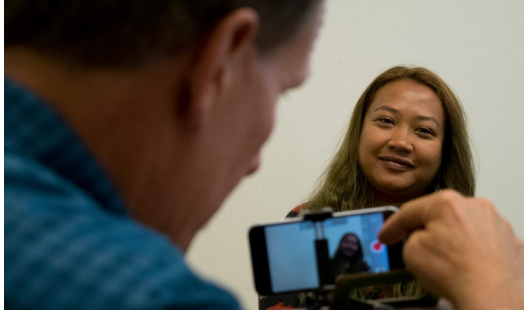
The advocates learned about the art of interviewing.