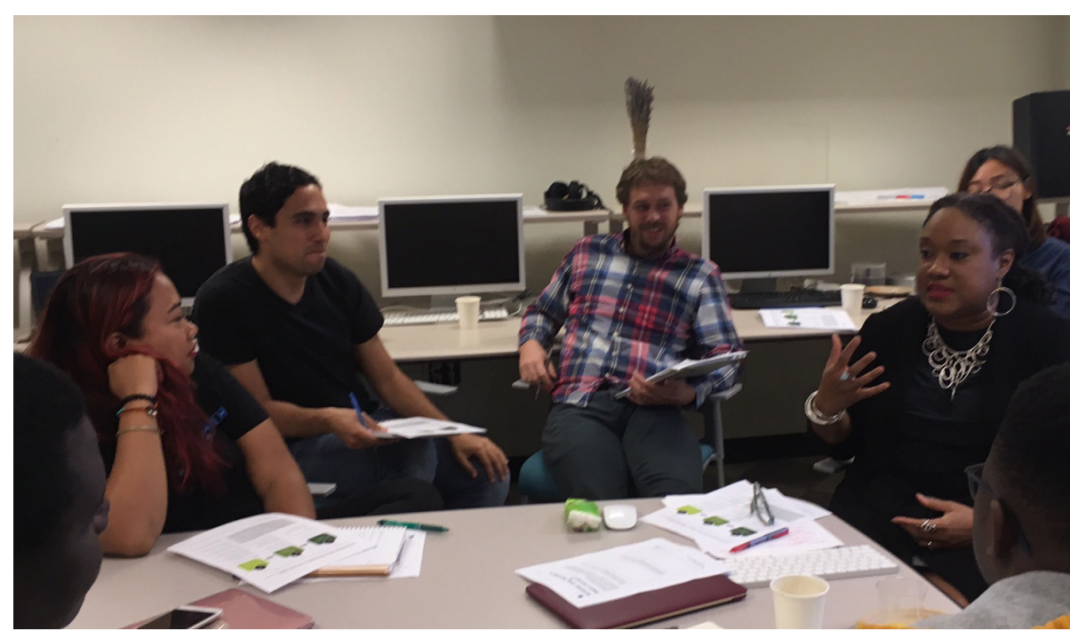
The Center for Teaching and Learning at Columbia University led a workshop on how the advocates can use new media and emerging technologies in their advocacy work.