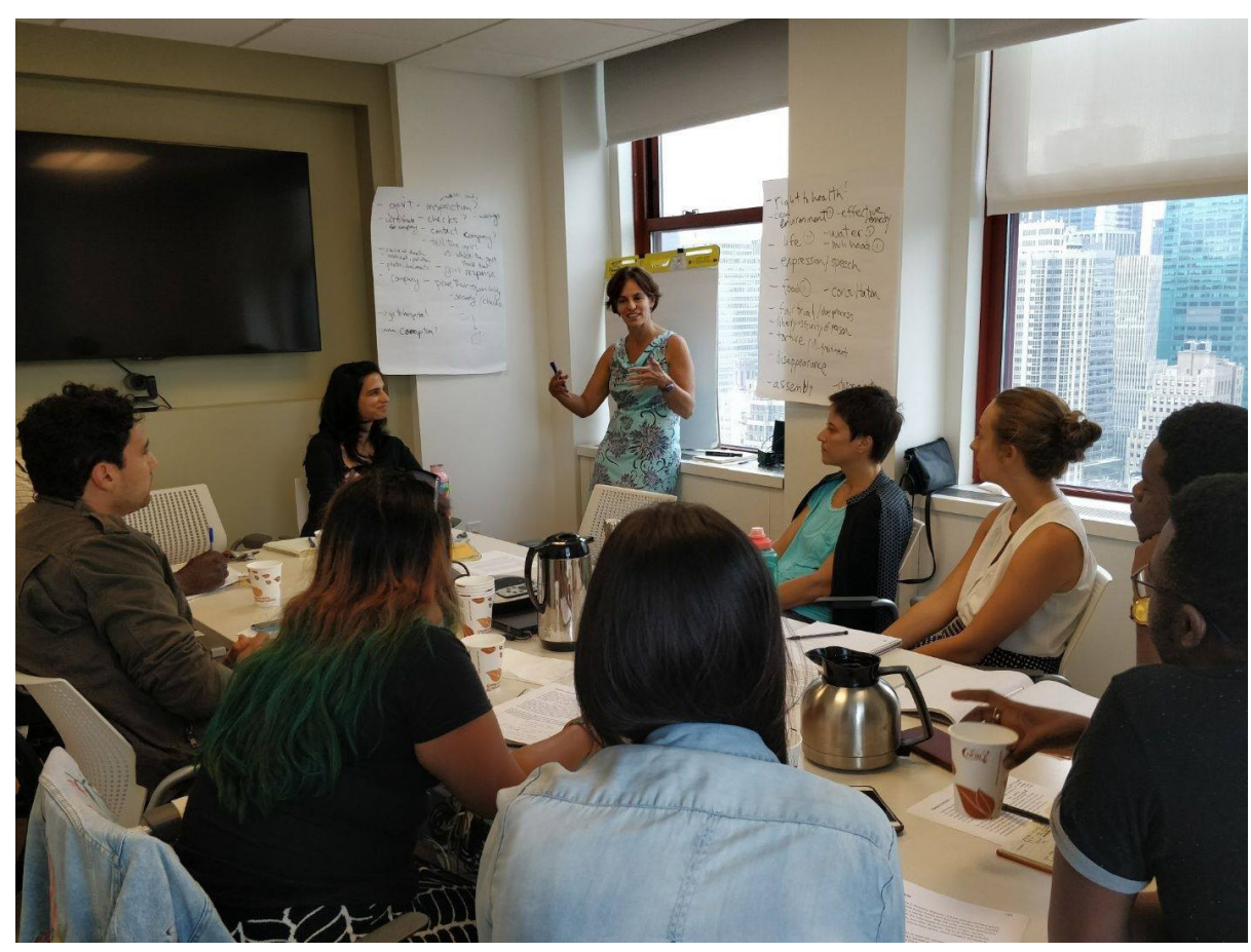
Human Rights Watch offers a six-part workshop on research, writing and documentation.